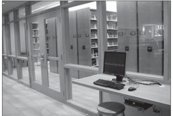
The collections are housed in compact mobile high density storage—sophisticated technology, yet simple to control and stunning to behold.