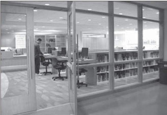
Entering the Music Library, you are welcomed by the warm maple wood glow, a bright and cheerful service desk, and the symbolic and symbiotic simultaneous presence of books and computers.

The first day of Spring Semester initiated a new era for music at Tufts, and the Lilly Music Library is prepared to support the anticipated growth and inevitable excitement created by the new Granoff Music Center. Music library research at Tufts enters a whole new era with the opening of the Lilly Music Library!