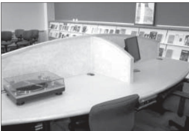
Studying a Beethoven score, listening to a classic LP recording of jazz great Charles Mingus never re-released on CD, researching dance music of the Middle East in our online music databases, reading the latest Opera News—you can do it all comfortably and in style at the Lilly Music Library's custom carrels.